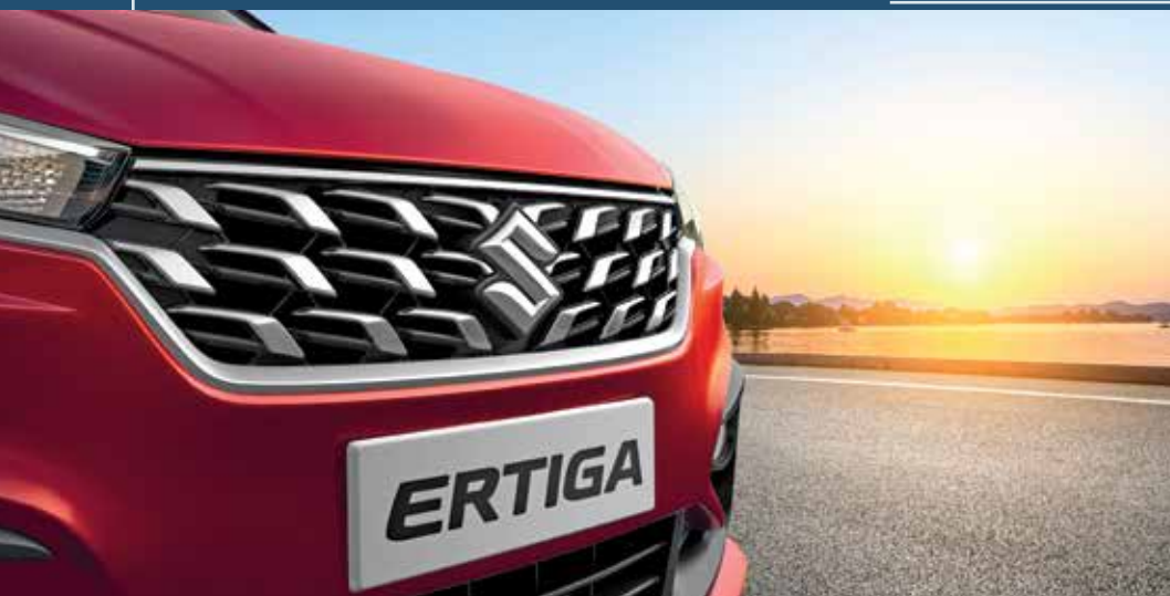
Dynamic Chrome Winged Front Grille The most stylish way to make an entrance.

● Elegant from every angle, the Ertiga is designed to bring out the stylish side of togetherness.