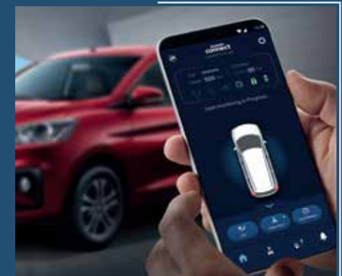
Connected Car Technology with Suzuki Connect Always stay connected with your car.