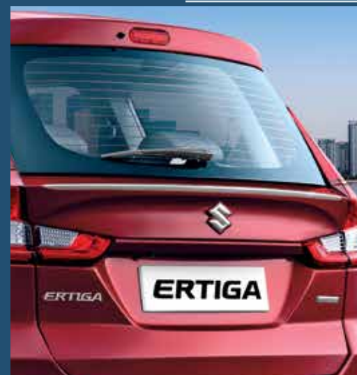
New Back Door Garnish with Chrome Insert Let those second looks chase you.