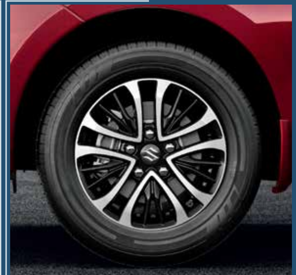
Machined Two-Tone Alloy Wheels Make a statement, every time.