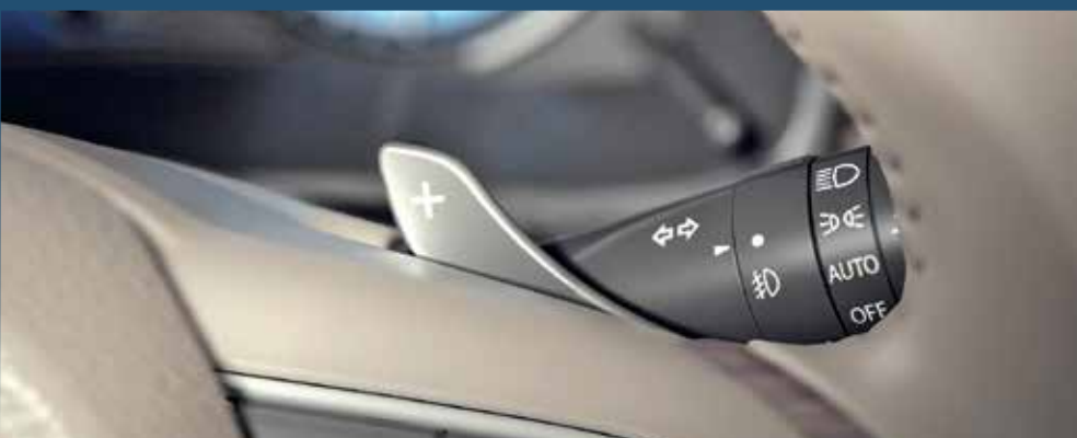
6-Speed AT with Paddle Shifters Surge ahead by engaging the smart paddle shifters.

● Togetherness, driven by technology. The Ertiga is equipped with state-of-the-art technology to add more fun to your moments of togetherness.