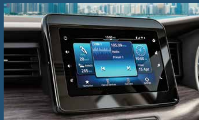
17.78cm Smartplay Pro Connect with your world with just a voice command - "Hi Suzuki".